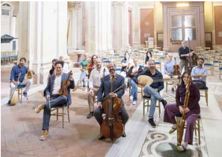
Musica Antiqua Latina Baroque Ensemble

Musica Antiqua Latina records for Sony Deutsche Harmonia Mundi