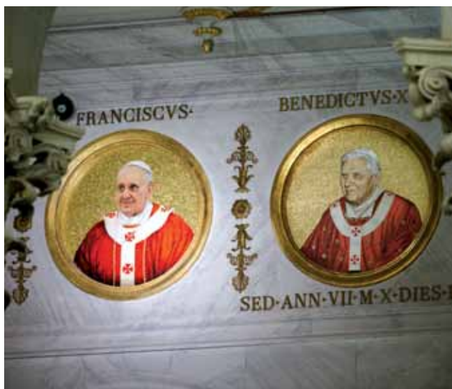
Papal Basilica St Paul outside the Walls Mosaic of Pope Francis and of Pope Benedict XVI