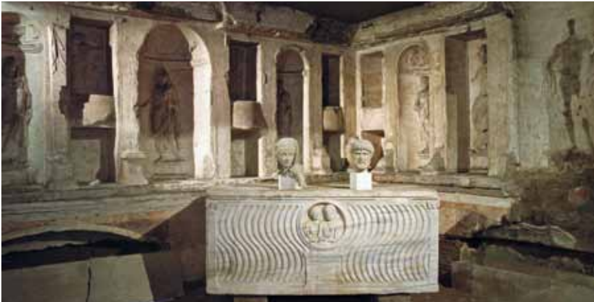
Mausoleum of the Valeri in the Vatican Necropolis

Each scholarship will be called the “Fondazione Pro Musica e Arte Sacra scholarship”.