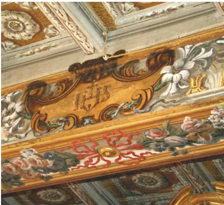
Rooms of St Aloysius Gonzaga in detail view of ceiling