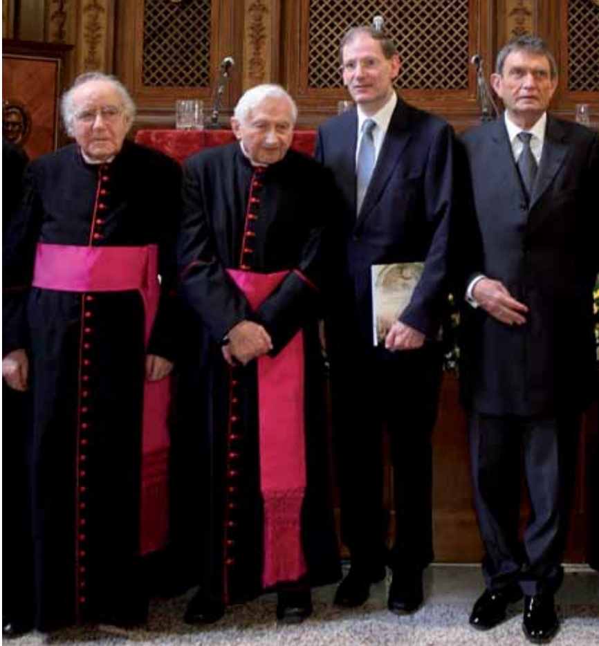
M° Msgr. Domenico Bartolucci