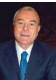
Dr. Gianni Letta