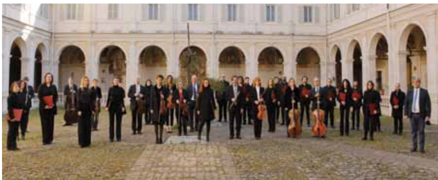
Choir and Orchestra of the Ludovicea Chapel