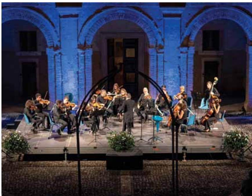
Orchestra Nova Amadeus

- La Traviata, Il Trovatore, Aida, Rigoletto, Macbeth, Nabucco, Attila, Giovanna d'Arco