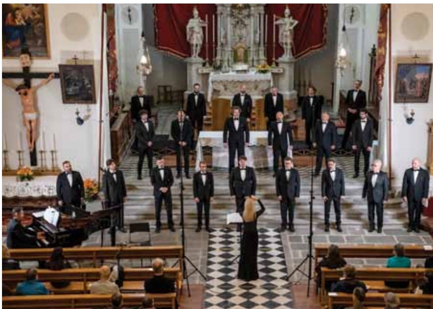
Il Polifonico / Italian Male Choir